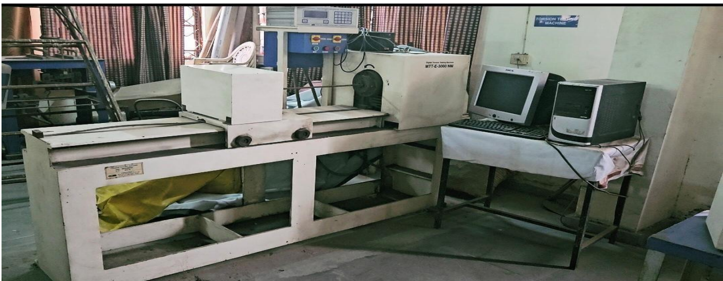
Torsion Testing Machine