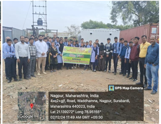
Steel Structure Fabrication Unit, Modcave shelter Tech Pvt. Ltd