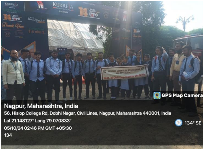
Mega Property Expo, Chitnavis Centre, Civil lines, Nagpur