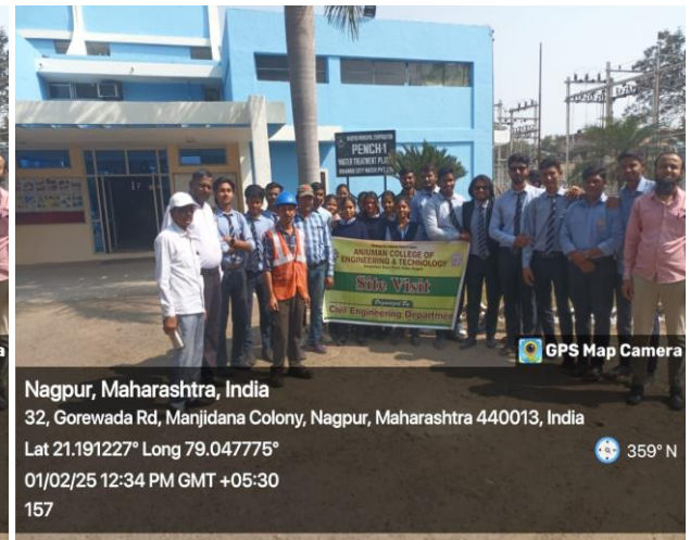
Gorewada Water Treatment Plant, Nagpur.