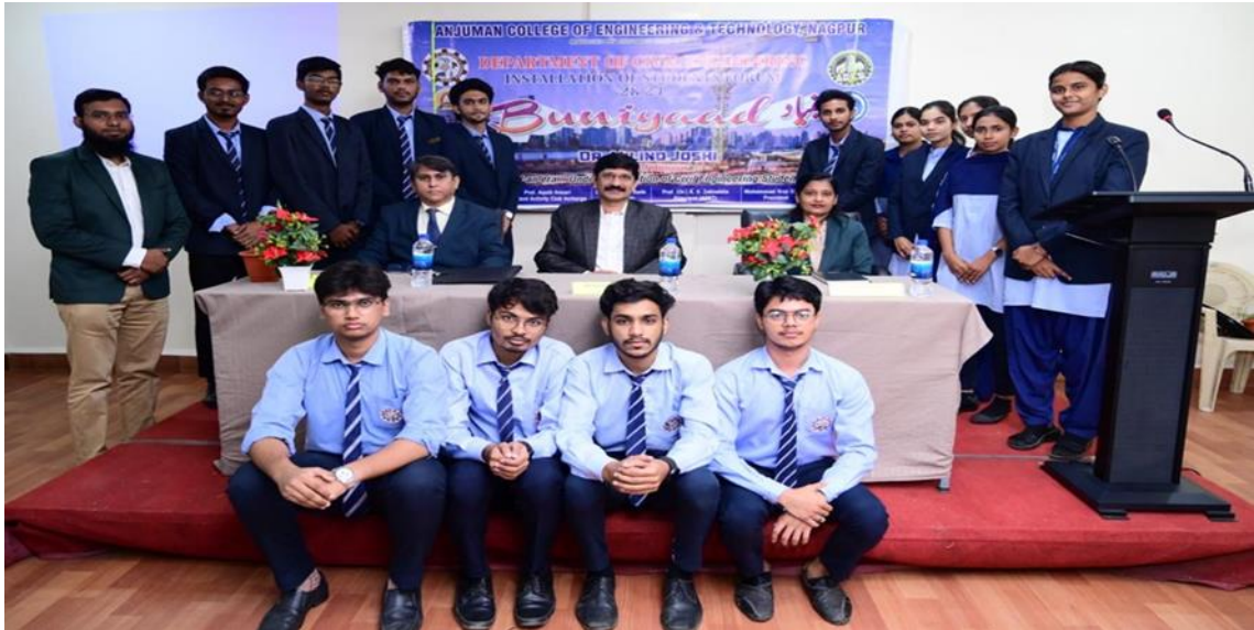
ACES office Bearers 2024-25