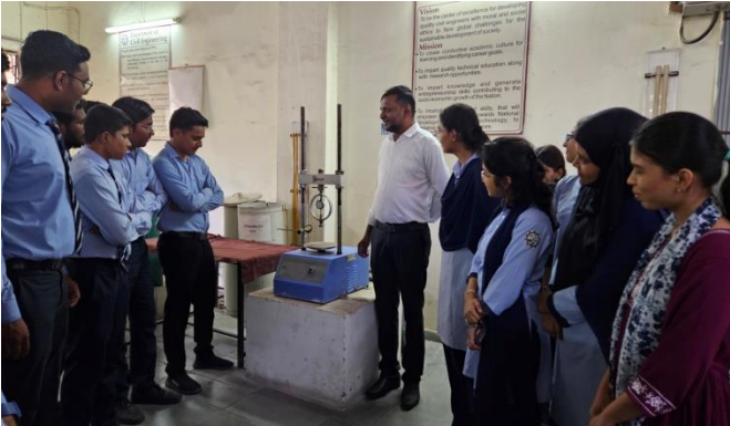
Geotechnical Engg. Lab