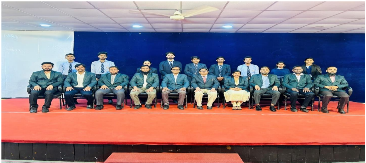
TOPPERS OF CIVIL ENGG. DEPARTMENT