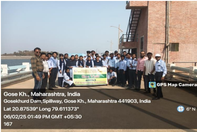
Gosekhurd Dam, Wahli (Puni)