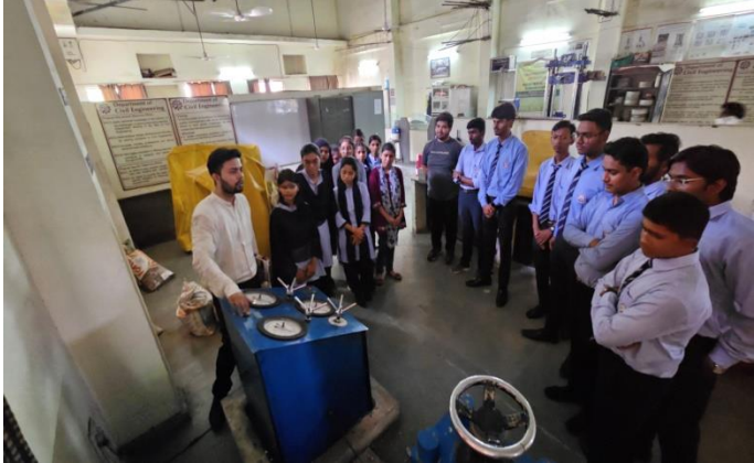
Concrete Technology Lab