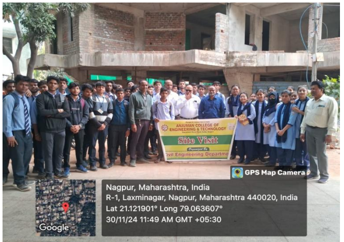
Cantilever Building, V.P. Kalambe, E Struct Consulting Engineers