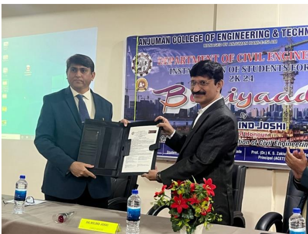
Surya EnviroTech (OPC) Pvt. Ltd., Nagpur