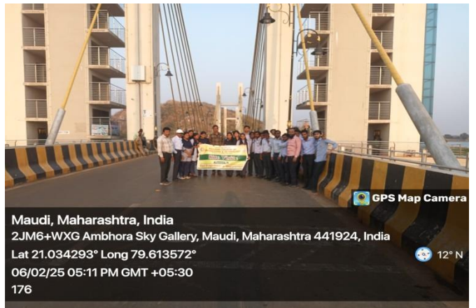
Ambhora Cable Stayed Bridge (Maudi, District Bhandara )