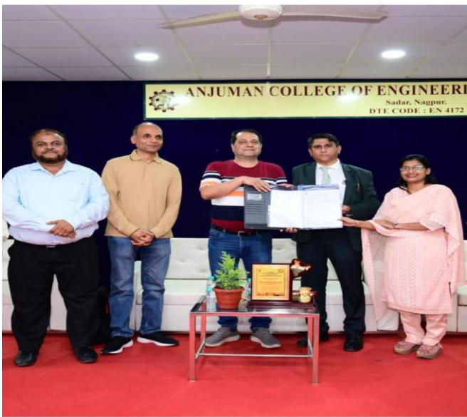
MOU NAGPUR FIRST, Nagpur