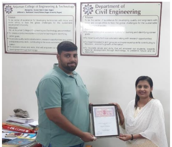
MODCAVE Ltd. Nagpur