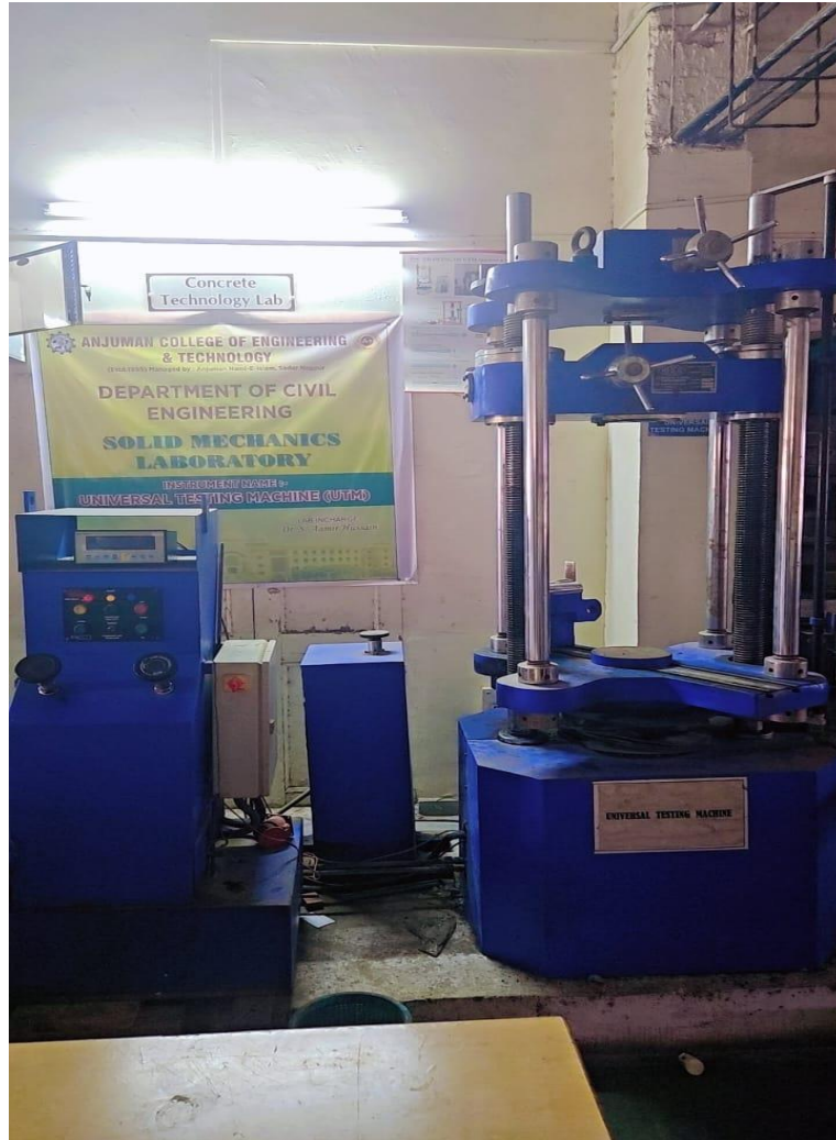
Universal Testing Machine