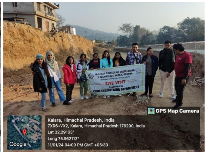
Industrial Tour to Himachal, India