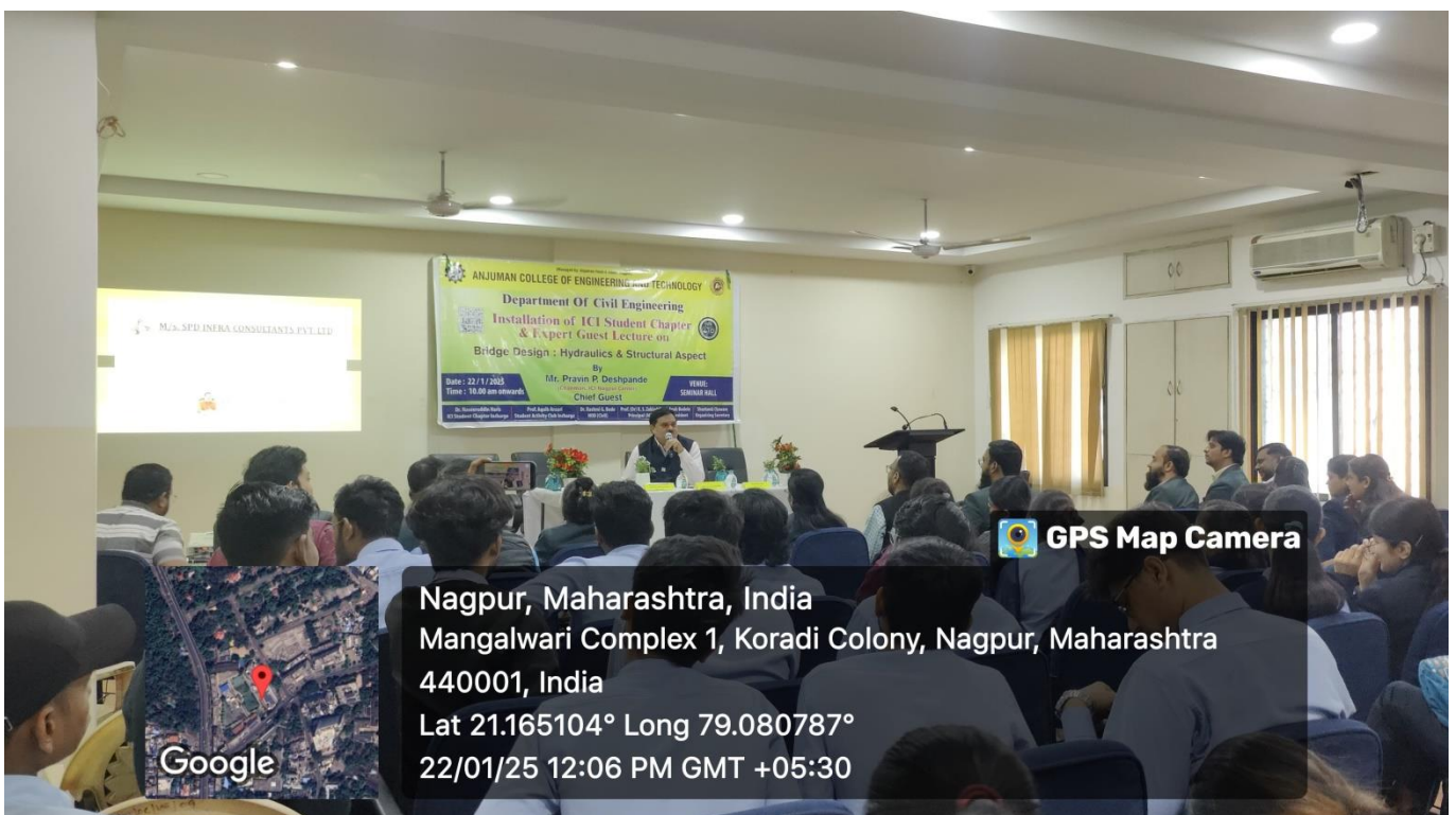
Tech Talk on ICI Installation Day