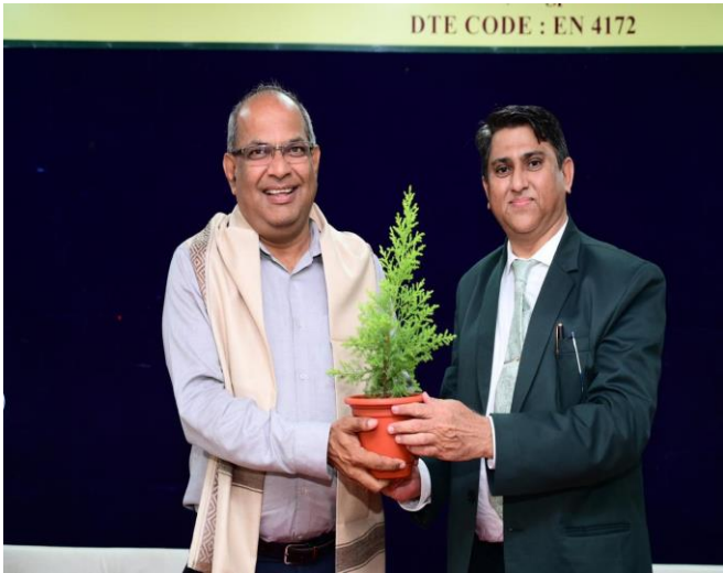
imaGIS Solutions Pvt.Ltd., Nagpur