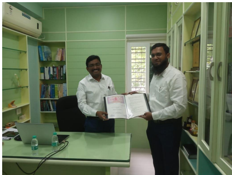
HITBHAV Engineers, Nagpur