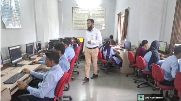
Auto CAD Lab