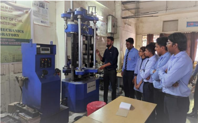
Strength of Material Lab