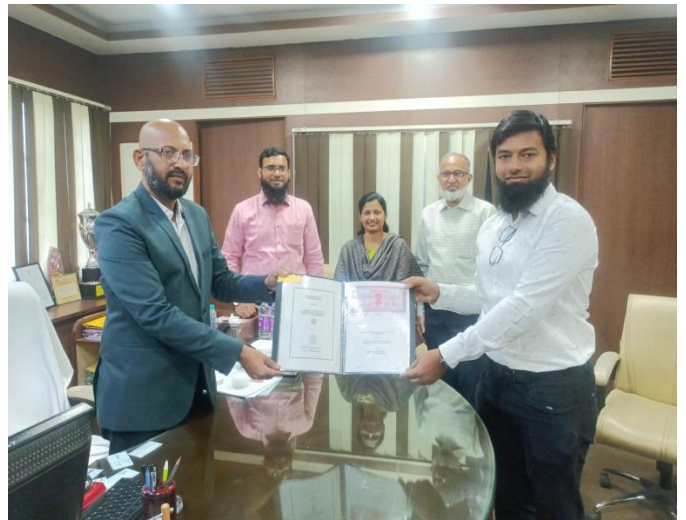
CC Precast Solutions, PVT.LTD., Nagpur