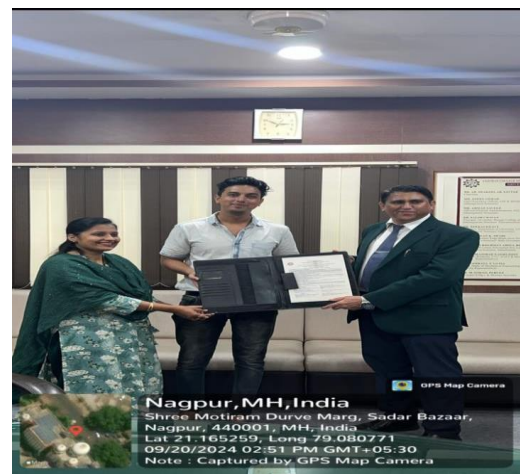
SDD Constructions, Nagpur